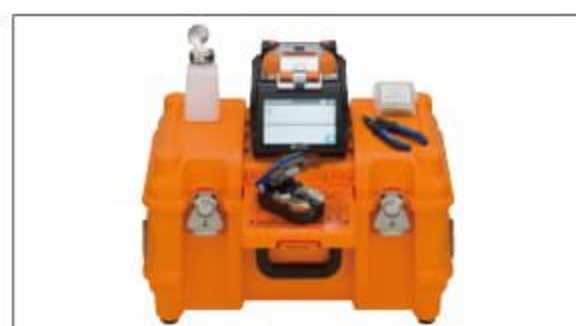
Carrying case with worktable CC-82

*X=2(USA), 3(EU), 4(JP), 5(UK/HK), 8(CHINA), 9(INDIA), 10(BRAZIL) Items listed in Basic Accessories are always included with the splicer body. Overall kit content may vary regionally. Please check with your local authorised reseller to confirm kit content in your region.