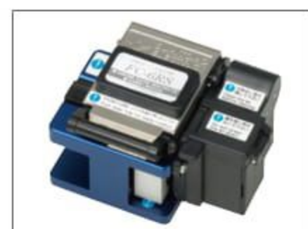
Table-top cleaver FC-6 / FC-6R series