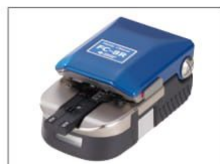
Handy cleaver FC-8R series