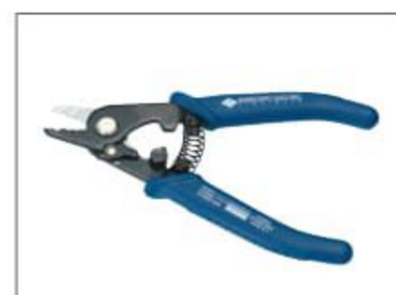
Jacket remover JR-M03